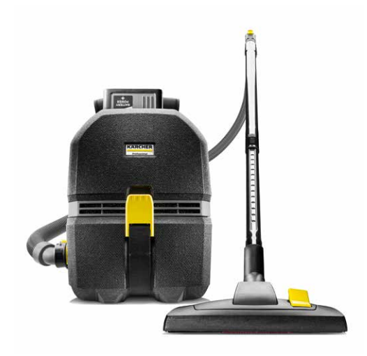
BVL 3/1 BP